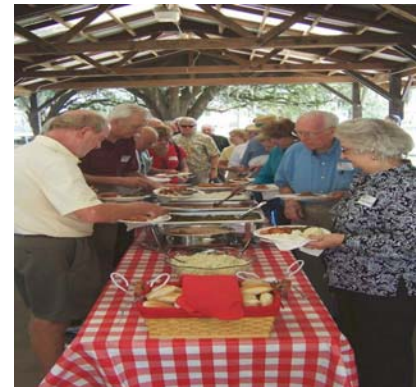
Charging through the Chow line