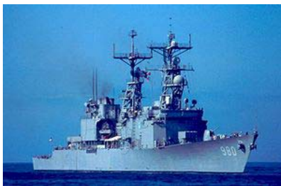
The USS Moosbrugger